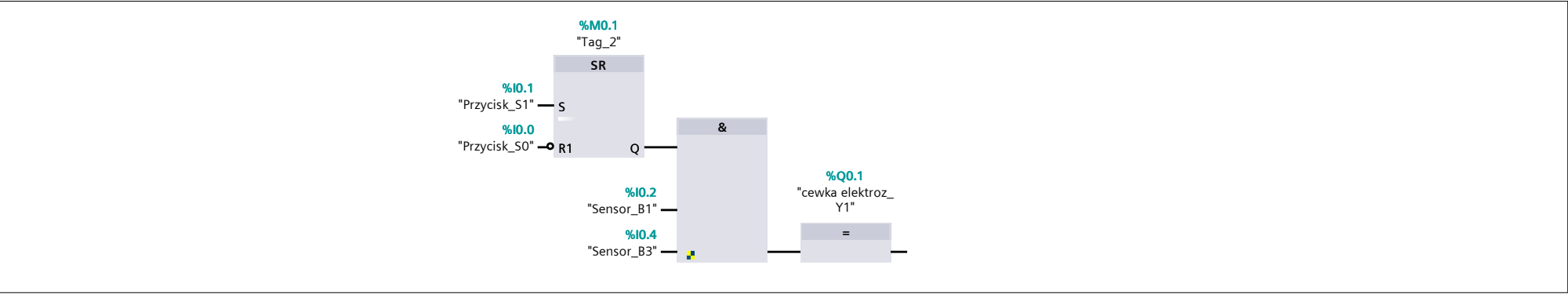
Network 2: Wysuw tłoczyska siłownika 1A2