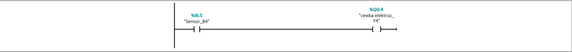
Network 5: Zapamiętanie stanu, że siłownik 1A1 wysunął się i wsunął oraz, że 1A2 nie osiągnął pozycji B4