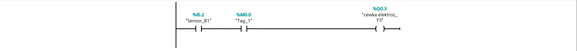
Network 4: Wsuw tłoczyska siłownika 1A2