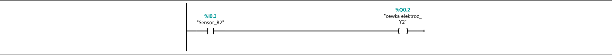
Network 3: Wysuw tłoczyska siłownika 1A2