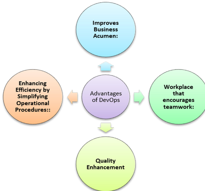
Figure 1.3: Advantages of DevOps

The use of cloud services has the capability to assist a business in developing tremendously. In the following Figure 1.3 , the advantages of DevOps are presented. Let us have a look at the benefits of DevOps in the corporate world: